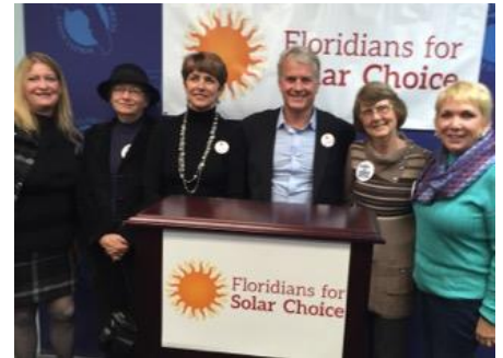
Solar Choice Press Conference

The Floridians for Solar Choice coalition acknowledges that the utilities' multi-million dollar misinformation campaign has succeeded in confusing voters and preventing Solar Choice from gaining a slot on the 2016 ballot. However, the coalition's goal remains unchanged: to open the solar market in Florida and encourage the development of clean and affordable energy through smart solar policy. As petitions are valid for 24 months from the date of signing, the coalition continues to explore options to qualify for the 2018 ballot and Solar Choice volunteers and partner organizations continue to collect petitions around the state.