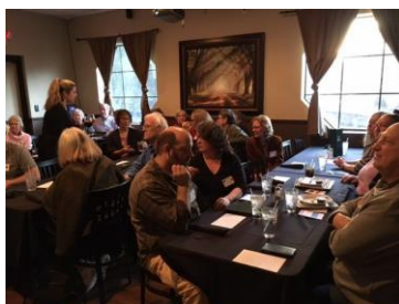
An interested Tavern Talk crowd