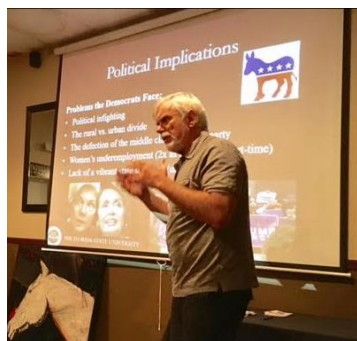
Type caption text here.