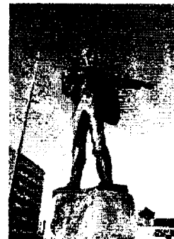
Statue of Jose Marti

The crumbling state of the spectacular architecture makes you sad and can perhaps overcolor your impatience with the political and economic decisions made by past and current political administrations. However, after a while, you realize that this is a country that has had a long and stormy history, struggled for centuries under the yoke of colonial and imperial powers, has made a valiant and largely successful effort to