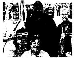
Candidate Meet & Greet

NOTE: Additional opportunities for Amendments Presentations and Candidate Forums are being presented to LWVT daily.